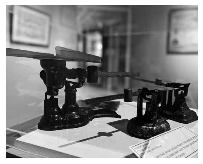
An early Fairbanks Scales Company package scale manufactured for the United States Post Office Department. Fairbanks was one of the main suppliers of scales to the Post Office Department.

Fairbanks: Weighing the World will feature a number of scales alongside photographs, documents, and other ephemera that tell the story of St. Johnsbury and the entrepreneurs who transformed it. It is on view at the Vermont History Museum from March 2 through July 27, 2024.